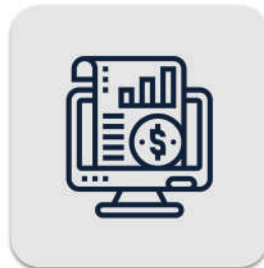
Accounting & Auditing