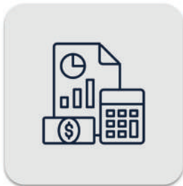
VAT & Tax Consulting