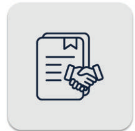
Investor Rights & Protection