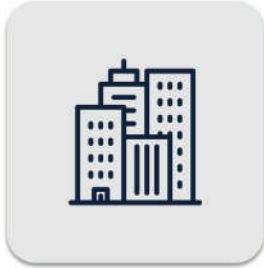
Company Formation & Licensing