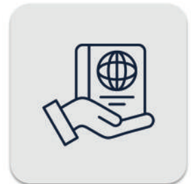
Golden Visa Services