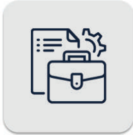
Business Centers and Office Space