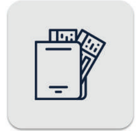
Visa & PRO Services