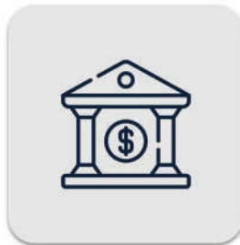
Bank Account Assistance