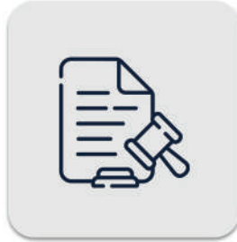
Legal Representative Services